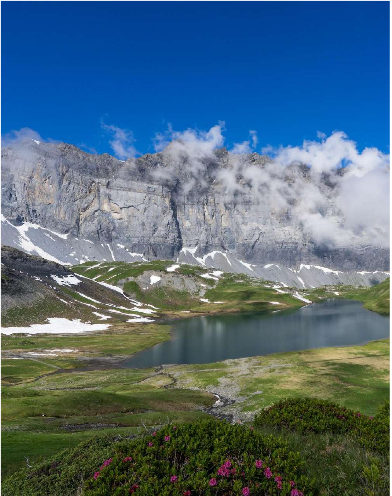
Massif des Fiz and Lake Anterne