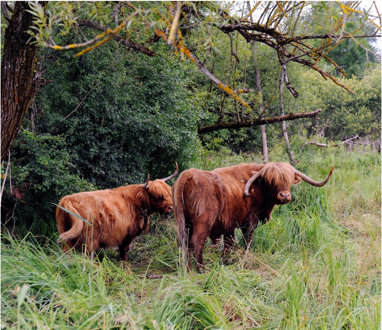
Highland cattle. A management practice that will undoubtedly be impacted by future changes

working on the restoration of a small river whose flow is managed by EDF, the manager of the hydroelectric plant located downstream. We would need a sufficient and variable flow to restore this functional riparian environment on the island and to restore an alluvial forest of soft wood. The current flow of 7m 3 /s negotiated with EDF is already at the lower limit. With the coming droughts, it might be even more complicated.